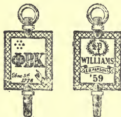
Small Size, No. 20, $4.50.

In purchasing keys we have had very satisfactory dealing with the firm whose card is given on this page. Their work is excellent and their prices reasonable. We can cordially recommend them to the members of the Phi Beta Kappa Fraternity.